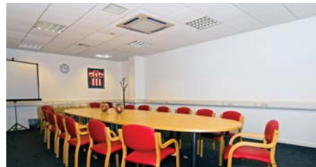
Cavendish Meeting Room

Non-residents are also welcome to utilise our office & meeting room facilities, which include 'hot-desks'.