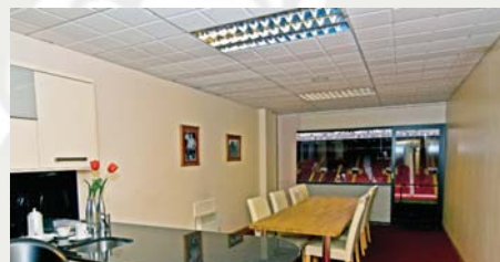
Forsyth Executive Box Facility

To discuss terms or to arrange a guided tour of the facilities, please contact the Centre Manager on 0114 292 2105